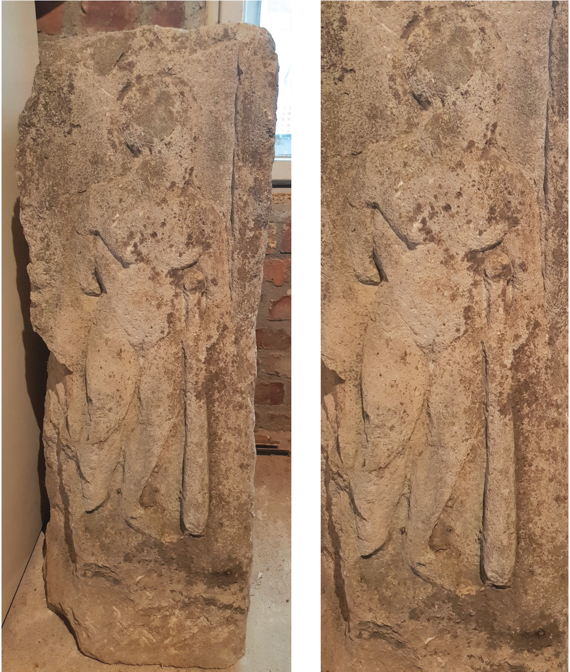
Fig. 1. The funeral monument, as it was found, at the residence of the perpetrator (a). Detail of the figurative representation (b)