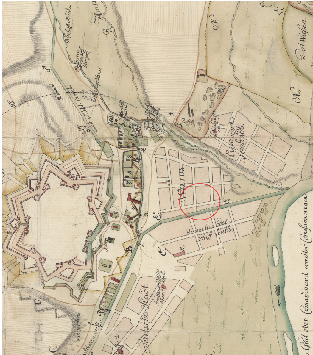
Fig. 2.M-39,1. Festung Karlsburg. Detail of the downtown: German neighbourhood (Deutsche Schtradt), Hungarian neighbourhood (Wáros) and Romanian neighbourhood (Lipowener Vorstadt). The red circle indicates the area wherefrom the monument was recovered.