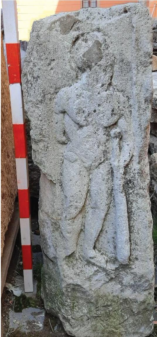
Fig. 3. Funeral monument, from Apulum, recovered by the judicial bodies (source: criminal case).