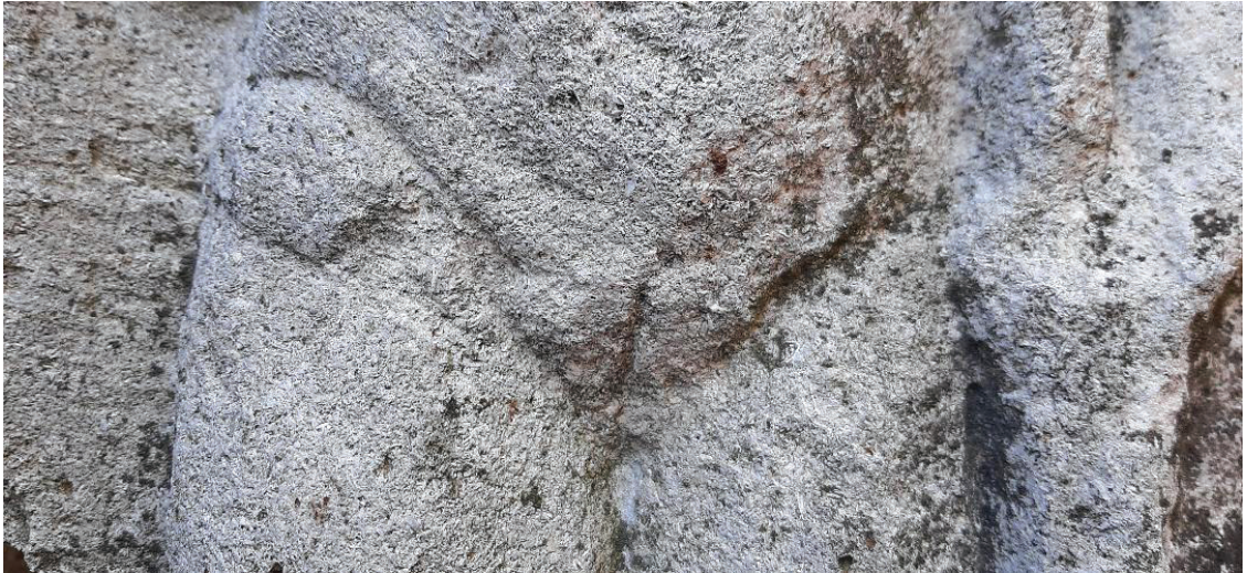
Fig. 5. Funerary monument, from Apulum, recovered by the judicial bodies (detail) (source: criminal case).